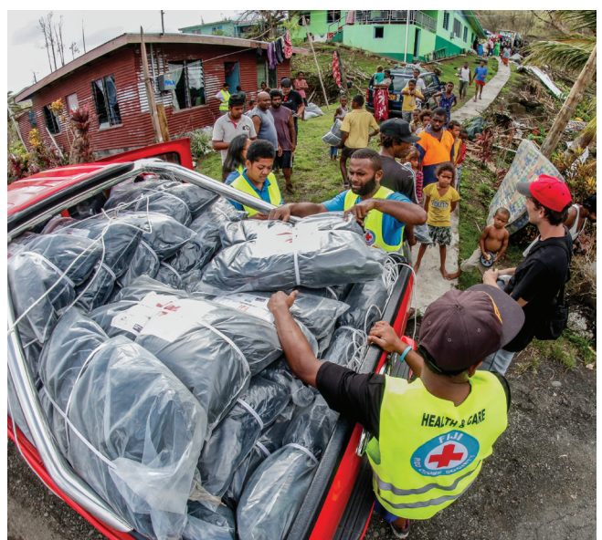
Australian Red Cross and the Australian Government worked together to replenish relief supplies that were being distributed by Fiji Red Cross teams in the Cyclone Winston response.

Immediately following the cyclone, Australian Red Cross was able to work with Fiji Red Cross and other partners to determine needs and priorities on the ground. This informed the launch of a public fundraising appeal and discussions with the Australian Government Department of Foreign Affairs and Trade. Funds could therefore be quickly allocated to dispatch necessary relief items and the deployment of aid workers with specific technical skills.