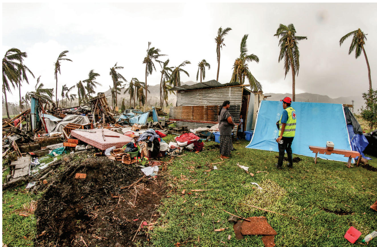
Cyclone Winston destroyed or damaged more than 32,000 homes on its path through Fiji in February 2016.

In January 2016, Australian Red Cross conducted a simulation exercise to test organisational readiness for large-scale emergency responses. A month later, Fiji was hit by the strongest cyclone ever recorded in the southern hemisphere. The simulation exercise helped Australian Red Cross improve the speed and efficiency with which it was able to support its local partner, Fiji Red Cross Society, in responding to Cyclone Winston . In particular the exercise helped Australian Red Cross clarify contact points for operational and logistical matters, improve understanding of safety and security processes, and strengthen public messaging in emergencies.