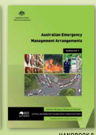
HANDBOOK 9 Australian Emergency Management Arrangements