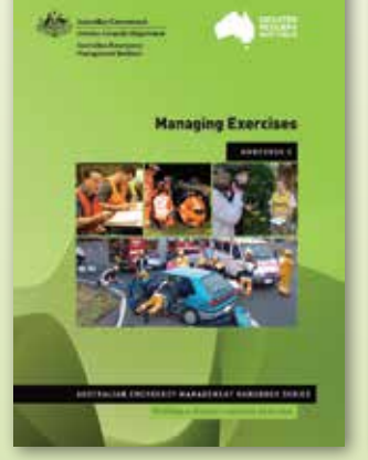
HANDBOOK 3 Managing Exercises