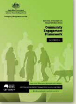
HANDBOOK 6 Community Engagement Framework