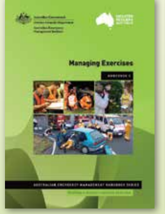
HANDBOOK 3 Managing Exercises