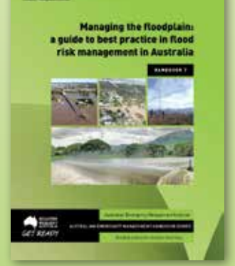
HANDBOOK 7 Managing the Floodplain

Download free eBook or order your own hardcopy via our new print-on-demand service at: www.em.gov.au/publications