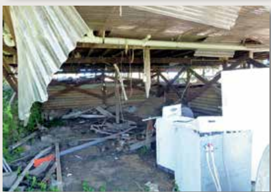
Field tests allowed participants to test the tools and make assessments