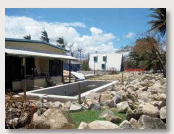
Damaged beachfront rock wall