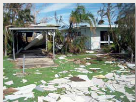
Asbestos containing material littered private, public and state land