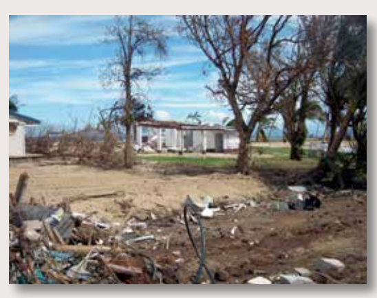
Tidal surge destroyed some houses