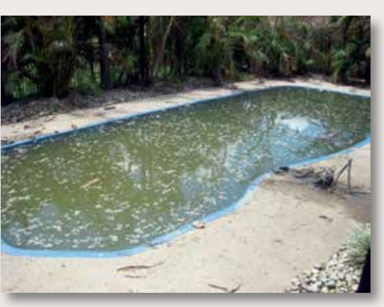
Raw sewage in swimming pool