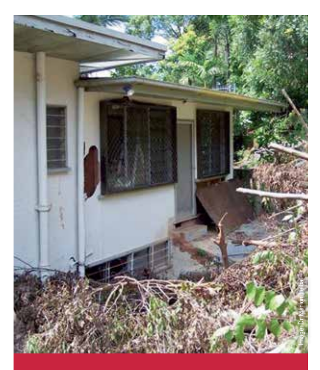
Fill failure in a disused road inundates a house in Cairns.

subsequently demolished and neighbouring buildings evacuated as well as the road temporarily closed. The contents of the restaurant, valued at more than $200,000, were lost.