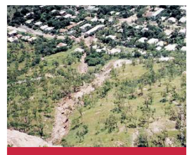
Large debris flows at Castle Hill were triggered by Cyclone Tessi.

Debris flows were a common cause of building impact. Almost half (11 out of 27) of the landslides affecting buildings were debris flows. For example, on 3 April 2000 at Castle Hill, Townsville, Queensland, four debris flows, three east facing and one northeast facing each with a volume of about 500 cubic metres weathered granite, were triggered by torrential rain from Cyclone Tessi. Almost 140 houses were initially evacuated and several were damaged by the runout. Several houses had a