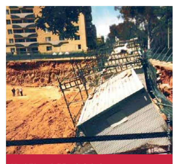
A landslide at a building site in Canberra causes two prefabricated site buildings to come off their foundations.

A spectacular, though less costly landslide happened on 27 November 2001 on the east side of Northbourne Avenue, Canberra, ACT, in the block north of Cooyong Street. Almost half of the western wall of an eightmetre-deep excavation failed, causing two prefabricated site buildings to tilt at angles of about 15-30 degrees. The headscarp consisted of two steps, each one metre high, coinciding with the inner edge of a concrete footpath. One lane of Northbourne Avenue was closed until 3 December.