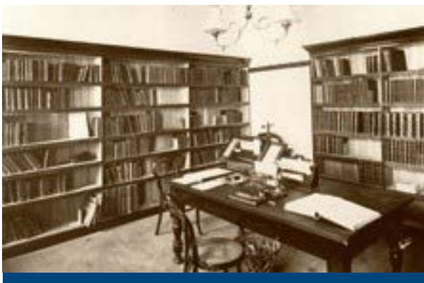
Government Chemical Laboratory Library, research area (circa 1920).

Information Research Services currently has 7.5 full time staff which includes the Library Manager, 4 x liaison/liaison support (including collection management and document delivery) and 2.5 staff in electronic and technical services.