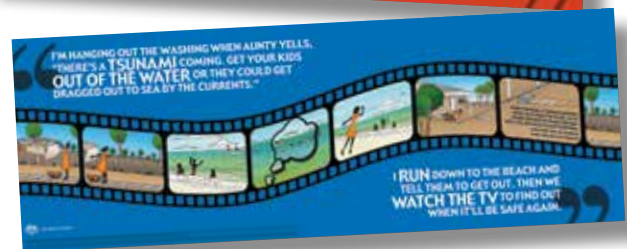
Posters aimed at raising Tsunami awareness amongst aboriginal communities