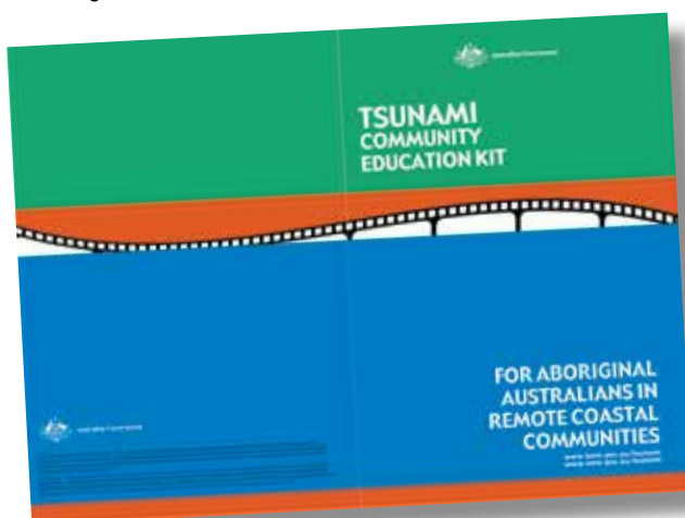
New Tsunami Education Kit