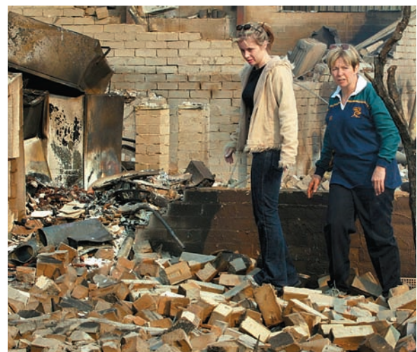
A sense of attachment to place and to others within community can influence preparedness.

In contrast to those participants who were predisposed to prepare, the decisions of members of the “not preparing” group were made in very different social contexts. Disagreement amongst family members regarding the need for or benefit of preparing was cited by the “not prepare” group as a reason for not preparing. They also described how a lack of resources, a low sense of belonging to where they lived, and unwillingness to collaborate with neighbours on clearing vegetation as reasons for not preparing.