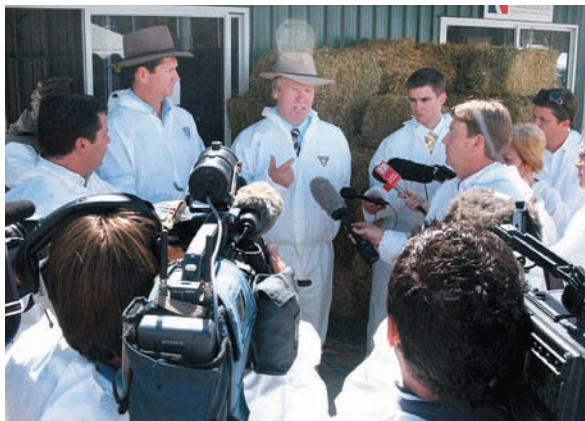
Media can assist in disseminating information to the public during a pandemic.

An awareness and understanding of these factors will help governments and authorities increase the compliance of the population with requests made during a pandemic.