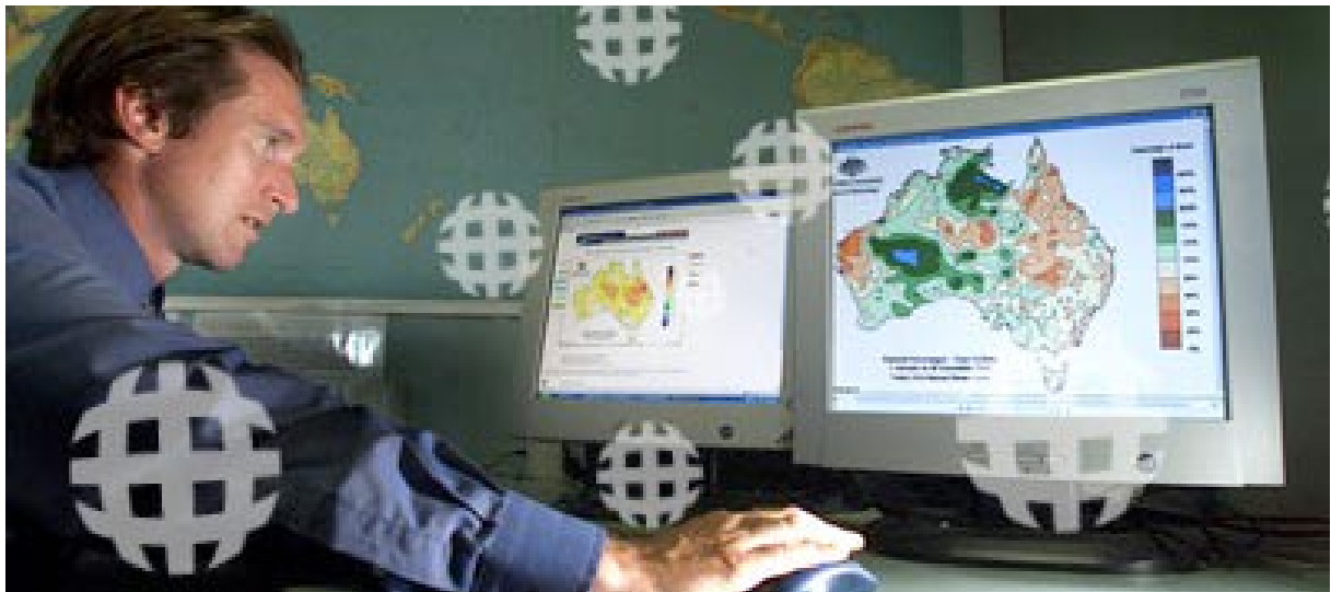
An early warning capability is the management integration of expert local knowledge with existing specialised systems and processes

integrates with traditional methods of communication, so that they can send emergency information out to every community and person at risk.