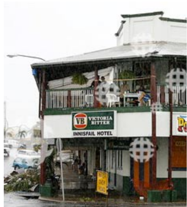
Australia is inherently vulnerable to natural disasters

In broad terms, social resilience is the capacity of a social entity (e.g., a group or community) to 'bounce back' or respond positively to adversity