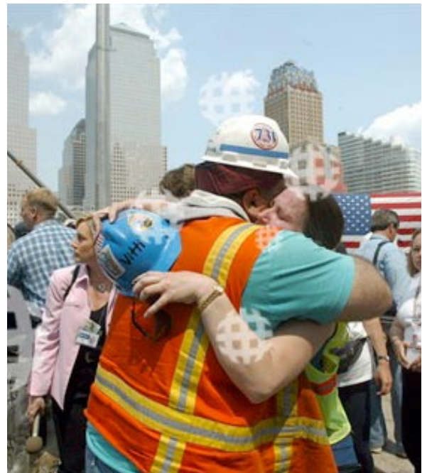
Response is one phase in a cycle of human reaction to disasters