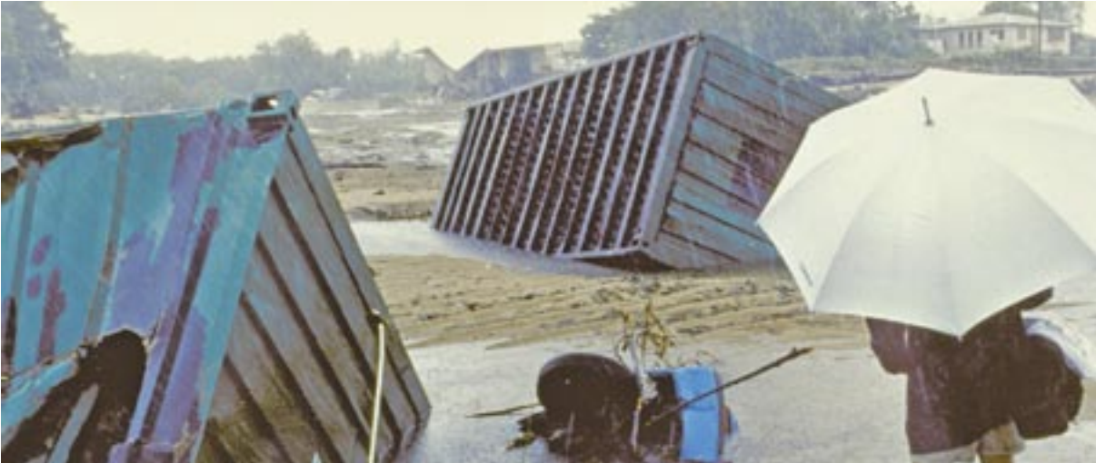
The principles of economics includes items of social and environmental value not normally bought and sold

1998) in North Queensland (Queensland Government, 2002b). This study was undertaken to assist with the development of the Guidelines , to provide a practical example, and to assess the economic impact of the floods on the economy and people of the coastal region from Townsville to Cairns.