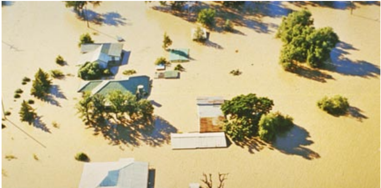
The Guidelines suggest that flood loss assessments are not adjusted for local circumstances

submitted to the Victorian Ministerial Task Force on Bushfire Recovery 2003. A sector map has been developed to identify both the tangible and intangible economic losses resulting from the bushfire. This map aims to clarify at which level of government, community and agency the impact might be experienced. A whole-of-government approach to this project has also provided access to the loss assessment data collected to date, and has helped the identification of gaps and questions still to be resolved.