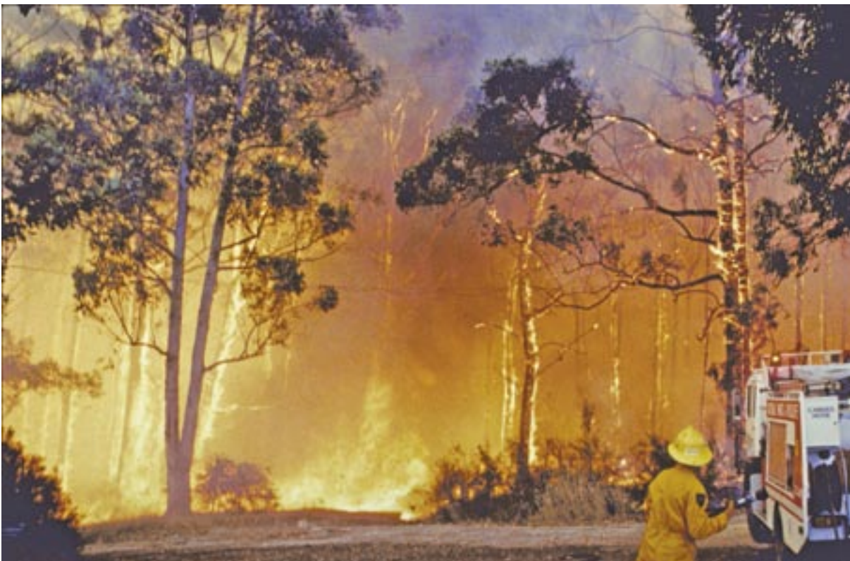
Many local businesses and farming activities come to a standstill to allow people to respond to the emergency

The Disaster Loss Assessment Guidelines (EMA, 2002) were used to assemble the data and information