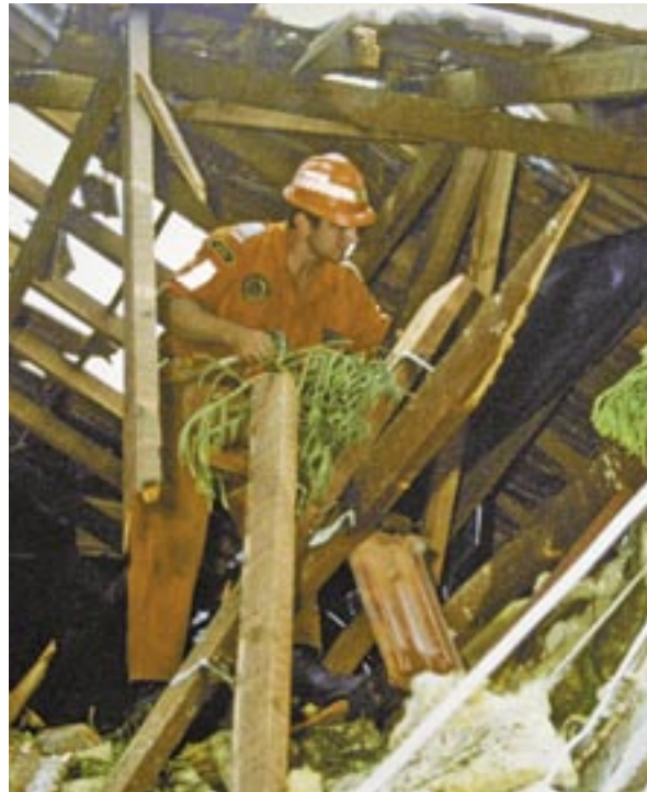
Damage to buildings and infrastructures are only a part of disaster loss assessment

In loss assessments economics is frequently confused with any analysis based on money. However, an economic analysis is based on a particular set of principles. In defining economics we follow long