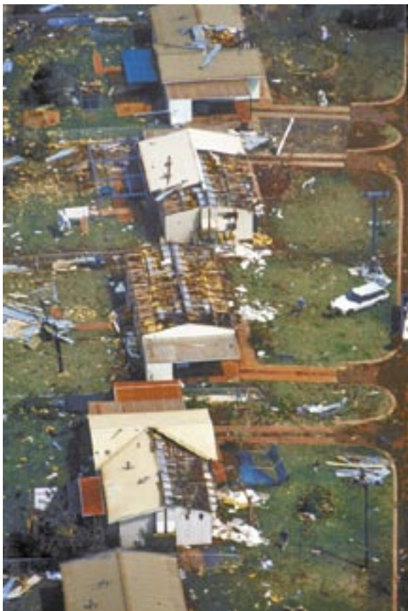
Use of case studies provided practical information to assess economic impact