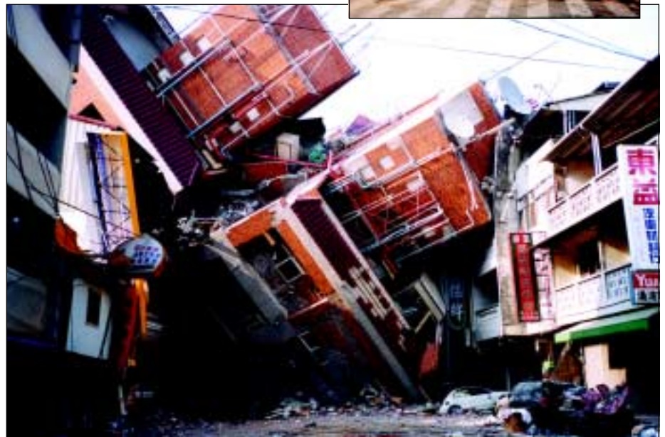
Above, inset: The quake of September 21, and subsequent aftershocks, caused the destruction of 10,984 structures and the partial collapse of 7563 buildings.