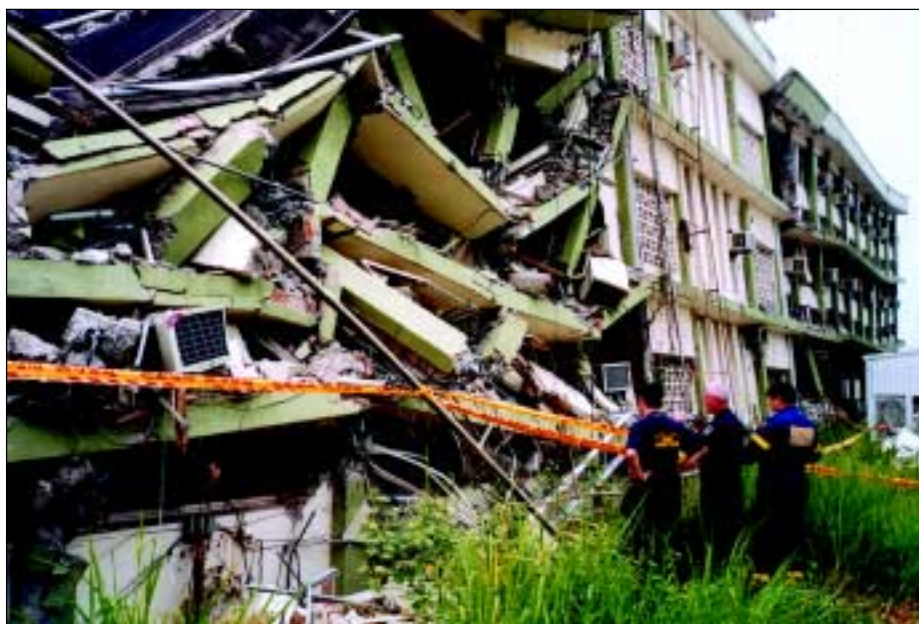
On arrival, the Australian team accompanied the UNDAC team on a reconnaissance of the affected areas.

in Nantou, Yunlin, Changhua, and Taichung. The Ministry of Foreign Affairs was assigned to contact and to receive international disaster relief experts. The Taiwanese Ministry of Foreign Affairs had established a reception centre at the Taipei airport.