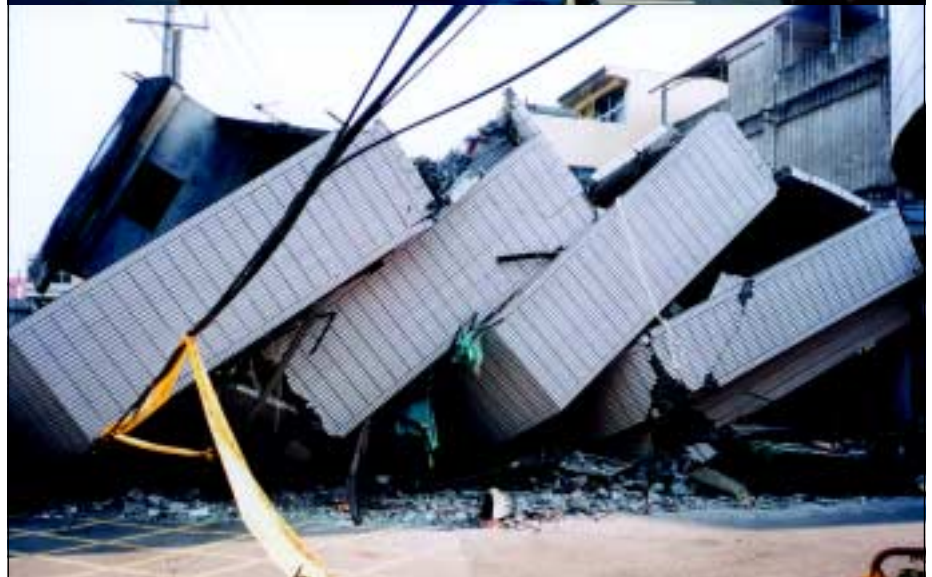
While traveling through the streets, the teams observed the random collapse of structures. Perhaps one or two buildings in a street had suffered major structural damage whilst the others were relatively intact.